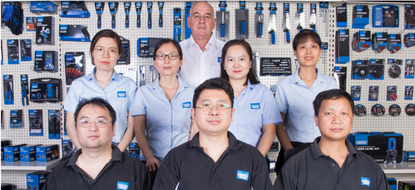
Our Shanghai team ensures suppliers meet our social, moral, ethical and safety standards...