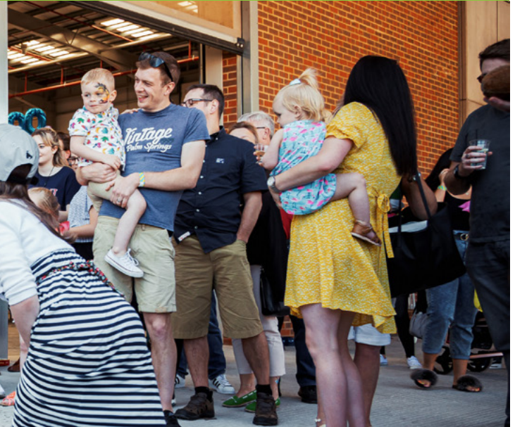
For us, fun and fundraising often go hand in hand...