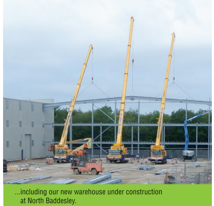
...including our new warehouse under construction at North Baddesley.

Because we believe that's the right thing for the environment as well as being good for business – and that's a great model for true sustainability.