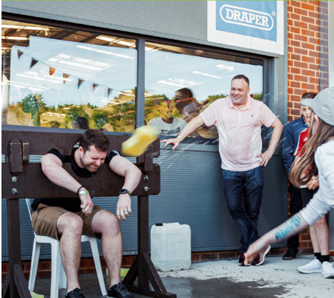
Small acts of generosity can make a big difference...