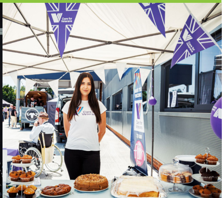
We're a family business and we respect the contribution of previous generations...